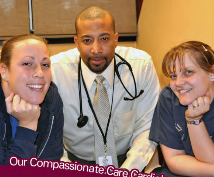
Our Compassionate Care Cardiology Team